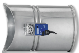
CONNECTION TO CIRCULAR DUCTS