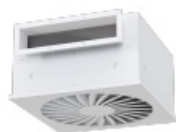
Side entry, rectangular spigot