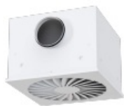
Side entry, circular spigot