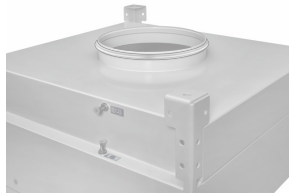
Circular spigot with lip seal