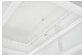
Pressure measurement point, detail