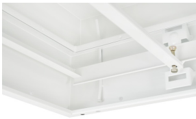
Internal measuring tube to sample particles for measurement