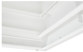
Test groove, detail