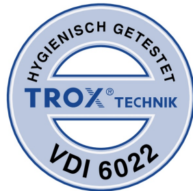
TESTED TO VDI 6022