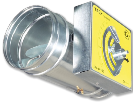
CAV CONTROLLERS TYPE RN-EX