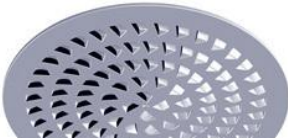
WAVEDRALL Serie WD