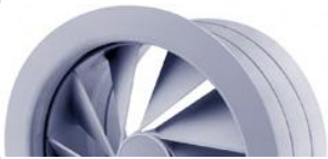
DIFFUSORE D'ARIA A EFFETTO ELICOIDALE SERIE RA