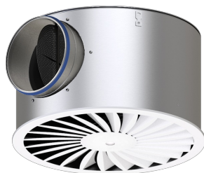
Circular diffuser faces with circular plenum box