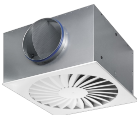
Square diffuser face with square plenum box