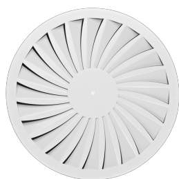
Round diffuser face