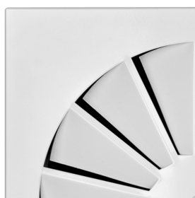
WITHOUT DISCHARGE NOZZLE