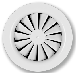
CIRCULAR DIFFUSER FACE