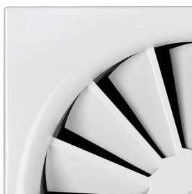
WITH DISCHARGE NOZZLE