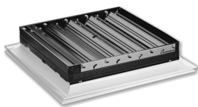
WITH DAMPER BLADE