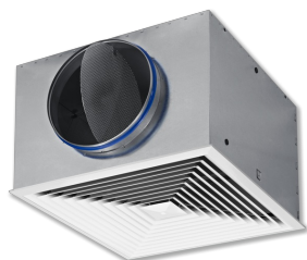
WITH PLENUM BOX