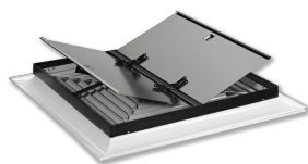
WITH BUTTERFLY DAMPER