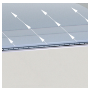
ANGLED ONE-WAY AIR DISCHARGE