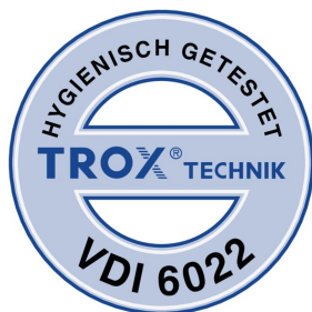
TESTED TO VDI 6022