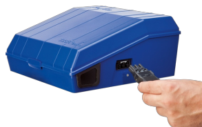
CONNECTION SOCKET FOR LIGHTING