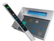
Beleuchtungsschaltung über Bedieneinheit